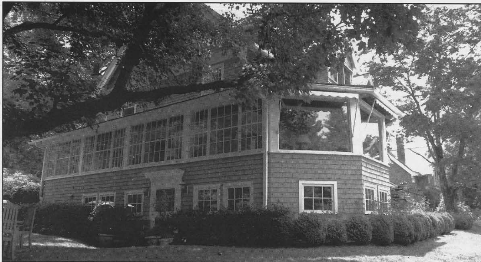
An exterior view of the main house at Aglin Farm in Washington.