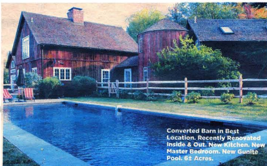
Converted Barn in Best Location. Recently Renovated Inside & Out. New Kitchen. New Master Bedroom. New Gunite Pool. 6+ Acres.

But act fast - with its affordable rentals, proximity to New York City and quiet country atmosphere, we don't expect Litchfield County to stay undiscovered for long.