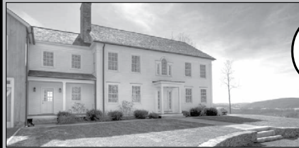
AMENIA, NY SOLD $2.85m