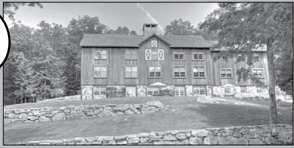
ROXBURY SOLD $7.75m