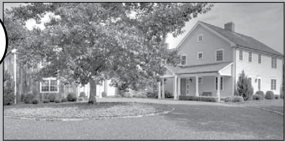
WASHINGTON SOLD $3.5m