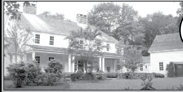
WASHINGTON SOLD $4.5m