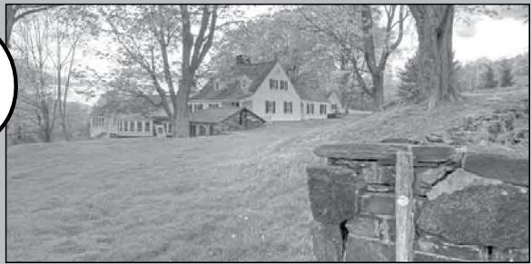
CORNWALL SOLD $2.325m