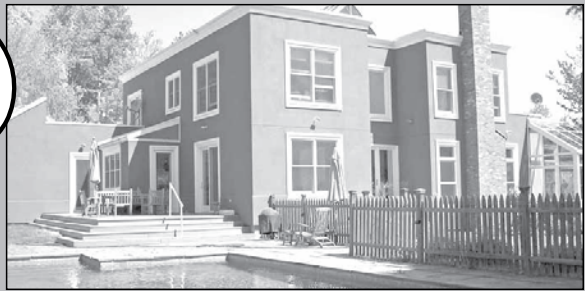
WASHINGTON SOLD $2.6m