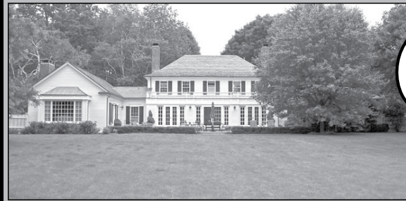
WASHINGTON SOLD $2.5m