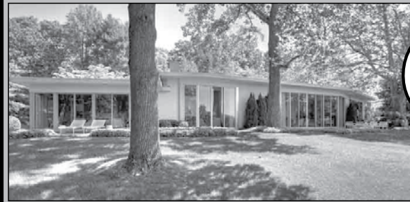
BRIDGEWATER SOLD $2.19m