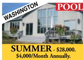
Private Renovated Home. Updated Kitchen. Pool. Guesthouse. Views. Jim Appleyard .