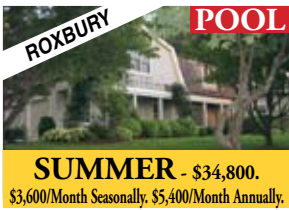
Recently Renovated. Gourmet Kitchen. Pool. Views. Privacy. Gael Hammer .