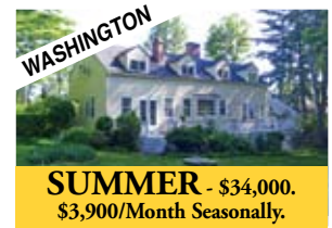
Light & Bright Renovated Cape. Distant Views. Quiet Country Road. Peter Klemm .