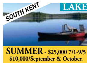
Newly Renovated Lake Getaway. 2 Bedrooms. Lake Views. Floating Dock. Peter Klemm .