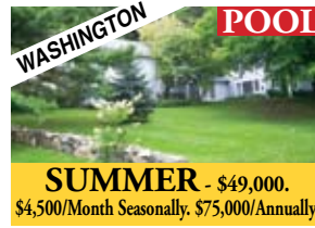
Newly Renovated 1910 Colonial. Central Air. Pool. 3.78± Acres. Peter Klemm .