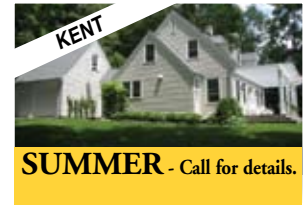
Meticulous Cottage. 3 Bedrooms. High-end Renovation. Private. Graham Klemm .