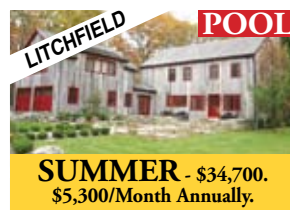
Beautiful New Construction. Pool. Pond. Total Seclusion. 13± Acres. Gael Hammer .