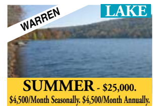
100' Frontage on Lake Waramaug. Dock. Access to Town Beach. Jim Appleyard .