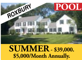
Private Country Home. Pool with Spa & Outdoor Fireplace. 4.43± Acres. Peter Klemm .