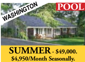
Renovated Nantucket-style Cottage. Infinity Pool. Views. 25± Acres. Peter Klemm .