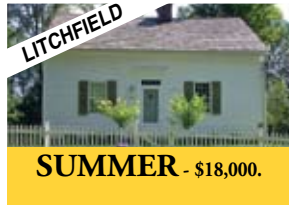
Quintessential New England Colonial. 200' River Frontage. 1± Acres. Joseph Lorino .