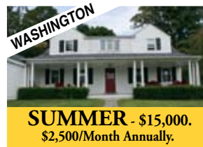
Malcolm Baldrige Home. Newly Renovated In-town Colonial.