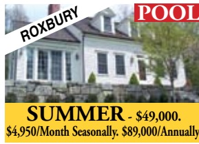
Renovated Country Home. Luxury Kitchen. Home Theater. Pool. Pond. Peter Klemm .