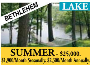
Direct Waterfront Long Meadow Pond. Deck. Dock. 3± Acres. Beverly Mosch .