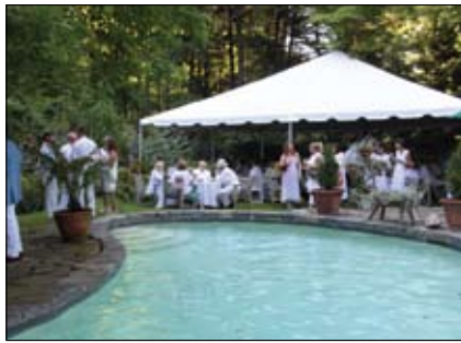
A festive group by the pool enjoying drinks and canapés. In 14 years no one has fallen in!