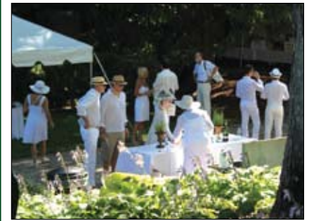
Thirsty guests refill at one of the three bars. Cases of wine were consumed and, of course, lots of iced tea!