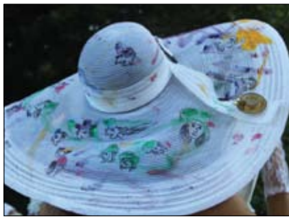
This year's Mad Hatter contest winner triumphed over 20 other contestants. Joan Crawford was the judge.