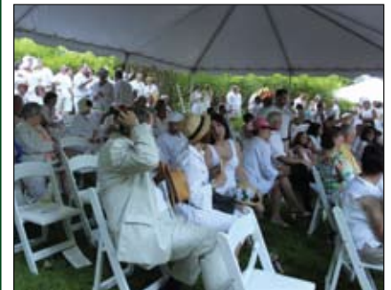
The crowd watches the hat contest in rapt attention. Everybody always has a great time cheering their favorites.