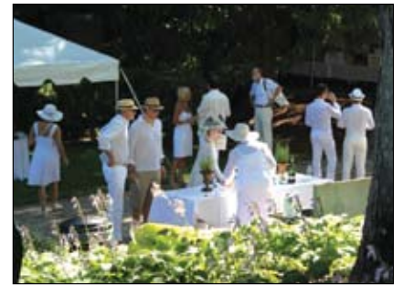
Thirsty guests refill at one of the three bars. Cases of wine were consumed and, of course, lots of iced tea!