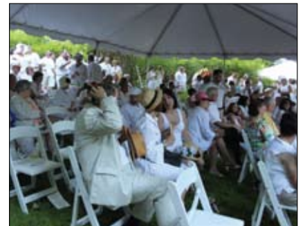
The crowd watches the hat contest in rapt attention. Everybody always has a great time cheering their favorites.