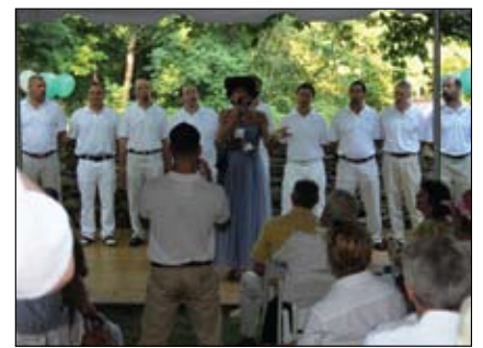
Miss Joan Crawford entertains with a song and dance number - backed by the Connecticut Gay Men's Chorus.